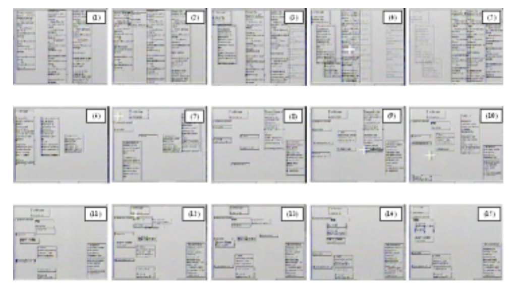
Figure 2, A Variety of Two-dimensional Positioning of Objects Emerged During a Writing Task