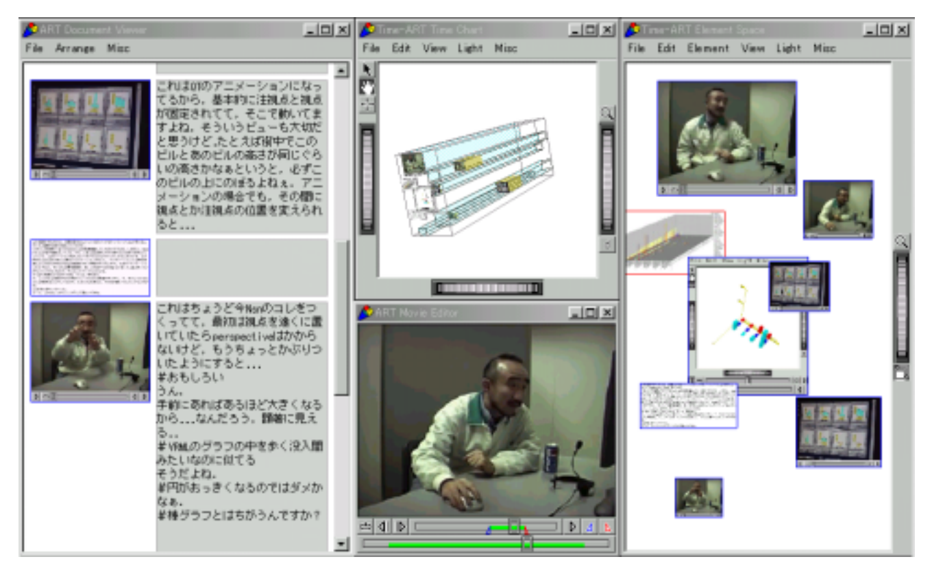
Figure 3: The Time-ART System